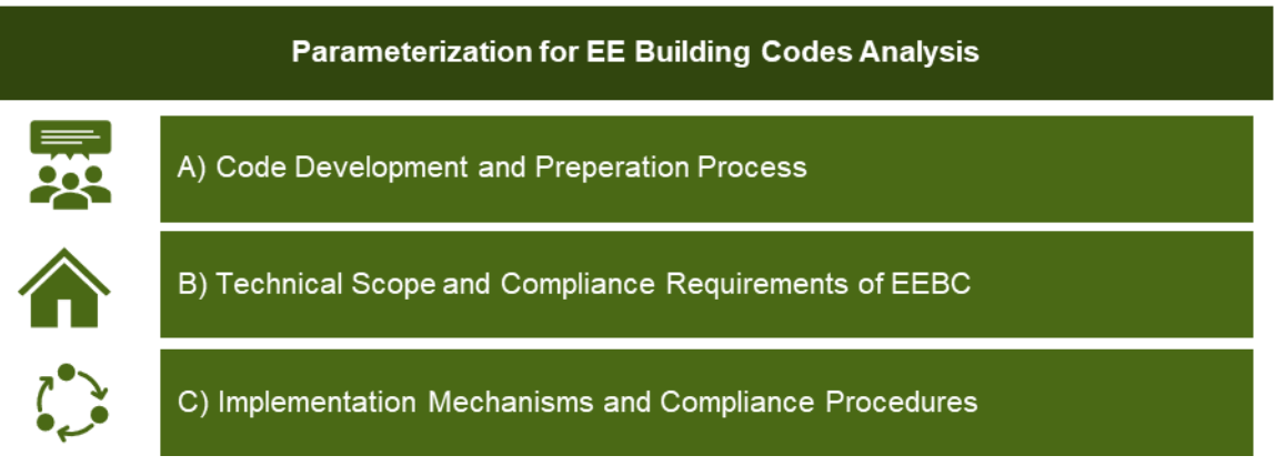
Figure 3 Categories of EEBC analysis parameters

The three categories of the EEBCs analysis are shown in Figure 3. Additionally, the topics and parameters which had been used as a basis for the data collection are listed in