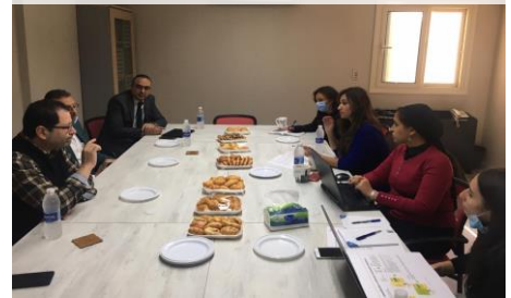
Meeting with key stakeholders in Cairo in December 2020.